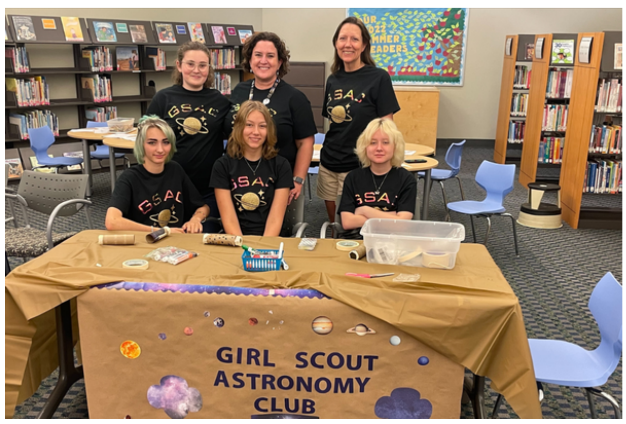
The GSSI Astronomy Club helped visitors make a simple telescope at the James Webb Space Telescope First Look Event at the EVPL Central Library on July 30.